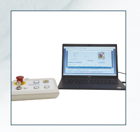
Advanced software interface defining eBt or SRT treatment parameters successfully