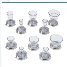
Smarter, dual modality treatment system with SRT and eBt capability

RADiant is the first dual-modality surface radiation therapy system offering a non-surgical treatment alternative that's smart, simple and successful—for your patients and your practice.