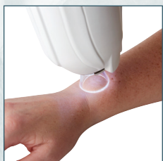
Simple positioning with illuminated halo applicators