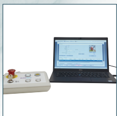
Advanced software interface defining eBt or SRT treatment parameters successfully