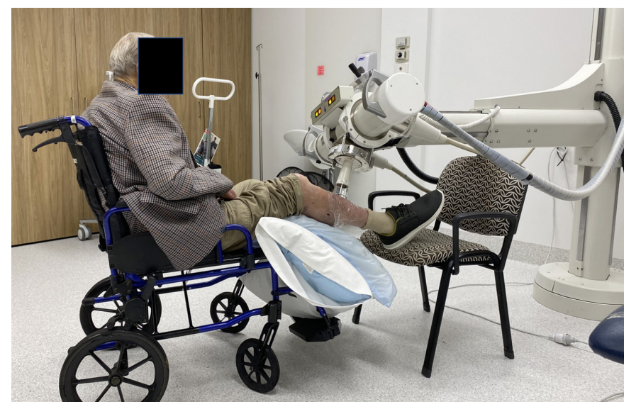
Figure 3 Leg treatment showing ease of set up with Xstrahl SXRT machine. Wheelchair bound patient having SXRT treatment to lesion on right lower leg. Ease of set up enables quick treatment without need for transfers from the chair to bed, minimising discomfort for patients and making workflow smooth and more efficient.