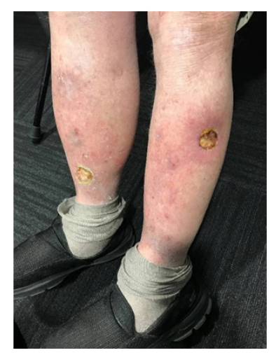
Figure I Radiation-induced ulcers on the lower legs following radiotherapy for non-melanoma skin cancers.